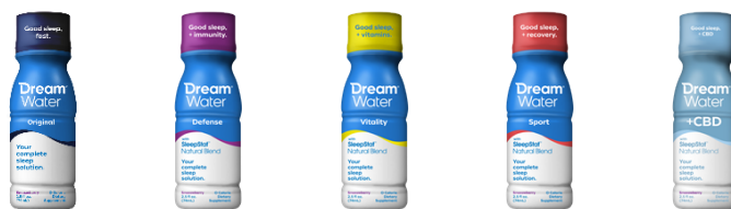
Dream Water Non-Melatonin

Dream Water continues to be forward-thinking with respect to international compliant formulas and line extensions in both the sleep-aids and CBD markets, including lines of products with multiple delivery formats for both categories. Formulation of CBD-infused Dream Water continues to advance and will enter the market when regulations allow in the US. The Company continues to build out a pipeline of innovation that addresses consumers' growing demand for effective sleep aids, in both OTC and cannabinoid-infused formats. Examples of potential new products are depicted below: