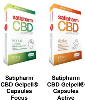
Satipharm CBD Gelpell® Capsules Focus

Satipharm continues to ramp up sales of its 10 mg full spectrum CBD Gelpell® capsules and CBD oil online and through brick-and-mortar distribution channels. In fiscal 2020 and future years, Satipharm will expand its product offerings and intends to launch new cannabis-based medical and nutraceutical products. Illustrations of Satipharm's planned new co-formulations for Europe are depicted below: