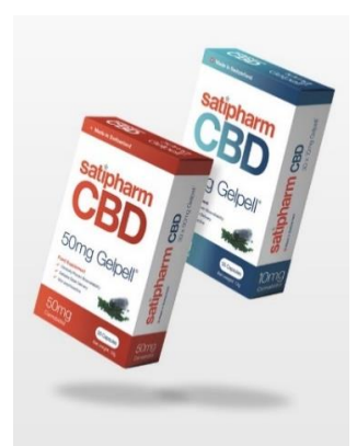
10 mg and 50 mg Gelpell® Microgel Capsules